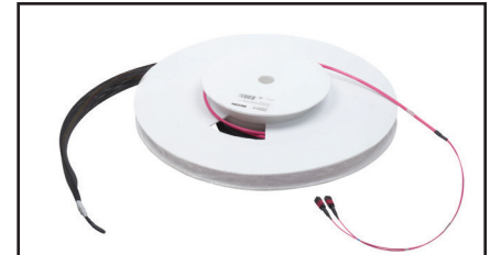
FM4MMB20025M, FX MPO Trunk, OM4, MPO-12 (Male to Male), Type-B, 2 x MPO-12 (24 fibers), 15 m, OFNP, uMini-Distribution, Fanout: 0.5 m x In-Line, Erika Violet Jacket