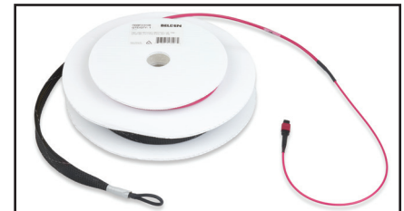
FM4MMB1010M, FX MPO Trunk, OM4, MPO-12 (Male to Male), Type-B, 1 x MPO-12 (12 fibers), 10 m, OFNP, Mini-Distribution 4.8 mm (Double-Jacket), Erika Violet Jacket